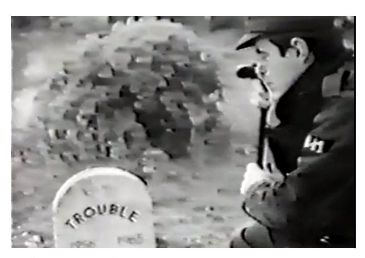
that thing I most like about time is

hotshot, the elite stance involved a certain relaxed contempt for the flesh. The body was meat. Case fell into the prison of his own flesh.